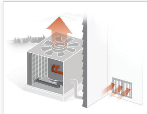
COOLING Heat is transferred from indoor air to the outside.

Air-Source Heat Pump owners are able to flip between heating and cooling from the thermostat.